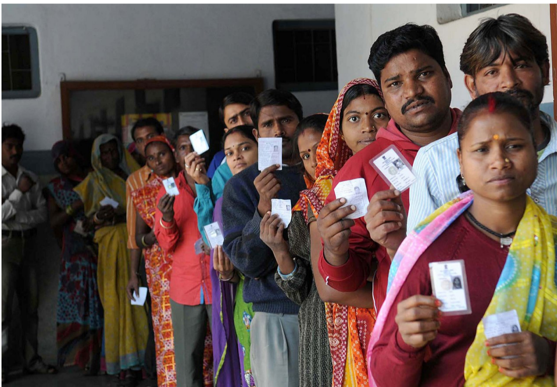
In India, strong electoral competition coexists with growing concerns over civil liberties and institutional balance.

India presents another kind of problem. On one view, its 2024 general election demonstrated the continuing vitality of electoral politics, with the ruling party losing the commanding dominance many had expected. On another, the condition of civil liberties, media freedom and institutional independence remains deeply troubling. The EIU's 2025 index reflects this tension, noting a decline in India's score amid concerns over electoral violence and pressures on civil liberties. It is here that the contrast between the indices is most instructive. One puts weight on the resilience of electoral competition; another focuses more heavily on pressures on rights and institutions. Neither approach is wholly wrong. But they are not asking precisely the same question.