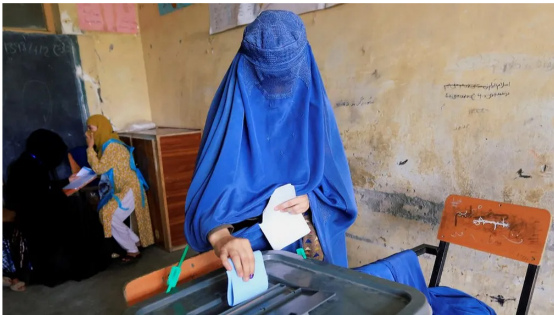
Rapidly imposed democratic systems in Afghanistan and Iraq revealed the limits of externally engineered political change.

The second is how a society can move from dictatorship to democracy without violence. Examples of recent Western failure can be seen in Afghanistan, Iraq and Myanmar. One recurring issue is birthright voting, which I encountered in Sri Lanka.