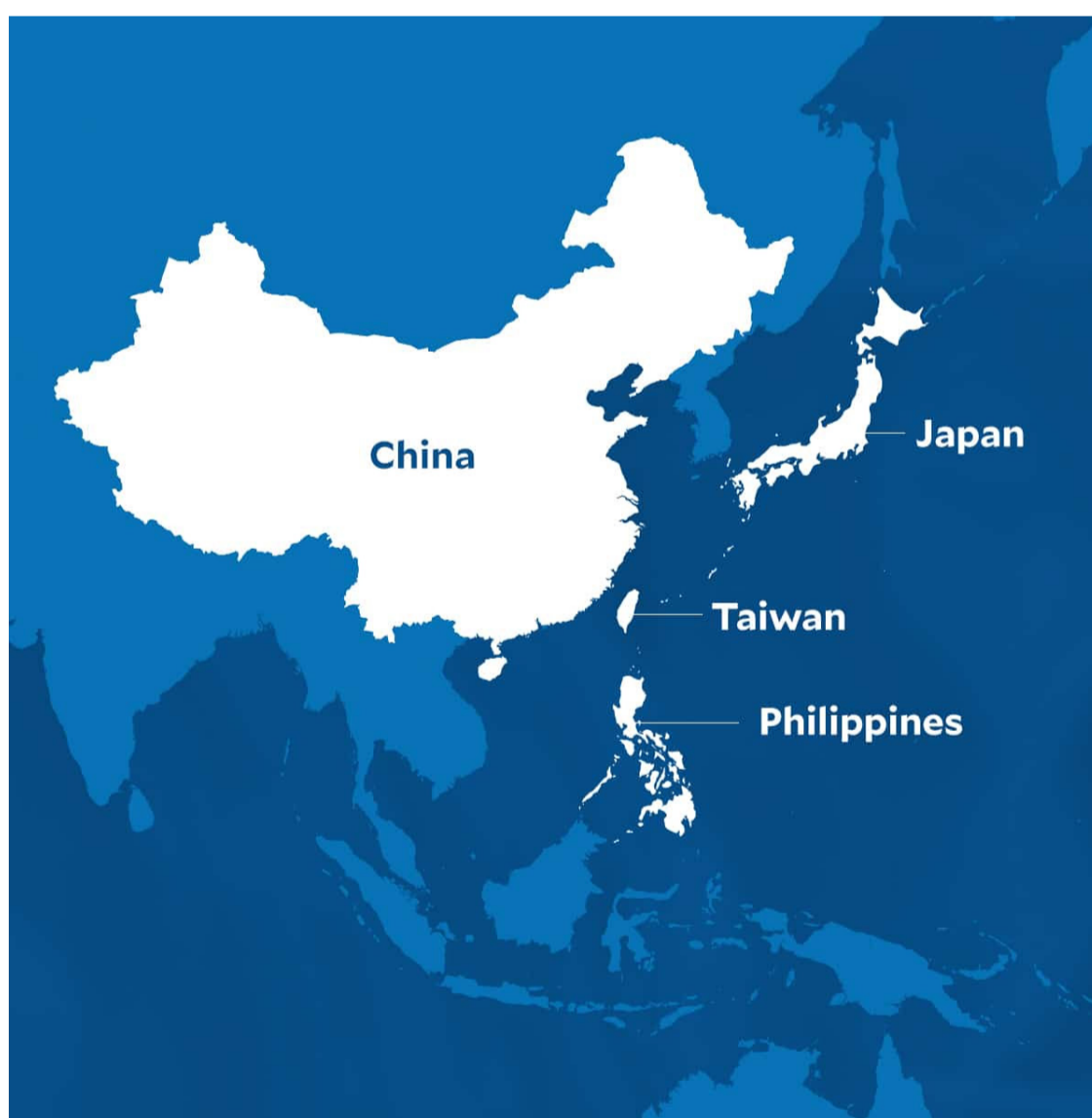
Despite political tension, economic interdependence between China and Taiwan has helped prevent open conflict.

A fifth element, critical to success, was building up trade with its enemy and, for that to work, both sides need to prioritise the economy over ideology. Taipei has not sent insurgent bombers across the Taiwan Strait as a gesture of independence, nor has Beijing occupied an outlying Taiwanese island as a claim of sovereignty. Instead, China-Taiwan business has created such wealth that everyone would have too much to lose if political hostilities turned to violence. In too many places, such a pragmatic trade-based approach has not been the case.