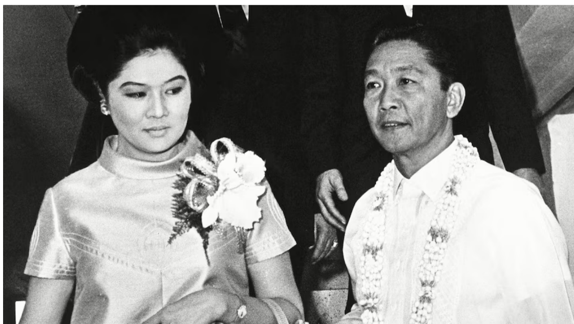
The fall of Marcos did not bring stability, but a turbulent cycle of coups and democratic fragility.

In 1987, I was posted to the Philippines after the dictator, Ferdinand Marcos, was overthrown in street protests. I found myself reporting on regular and violent attempts by the military to take over the civilian government, bodies in the street, buildings burnt, attacks on the presidential palace and so on. Naïve politicians, vested interests, and weak institutions created a cocktail of failure in a society that had little understanding of the compromise needed to make a democracy work.