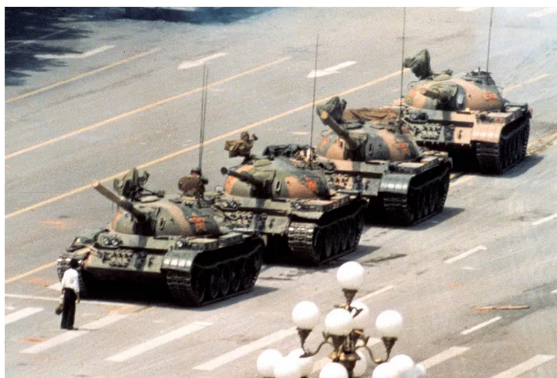
The 1989 Tiananmen Square crackdown reshaped global perceptions of China’s political trajectory.

The optics among British voters were appalling. How could the government allow such a ruthless regime to run Hong Kong? So, Chris Patten, a top-flight Conservative politician, was sent in as Hong Kong’s last governor. Patten’s job was to re-write the narrative so Britain could stage an honourable withdrawal.