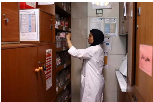
Medicine shortages and rising healthcare costs are leaving vulnerable patients across Iran at risk.

The economic consequences of the war, compounded by deep-rooted corruption, have been devastating. According to Iranian official statistics, the annual inflation rate has risen to more than 53 per cent, while food prices have reportedly risen by over 115 per cent. Several major industries, including steel, petrochemicals and car manufacturing, reportedly suspended operations during the war or cut production, triggering waves of layoffs across the country.