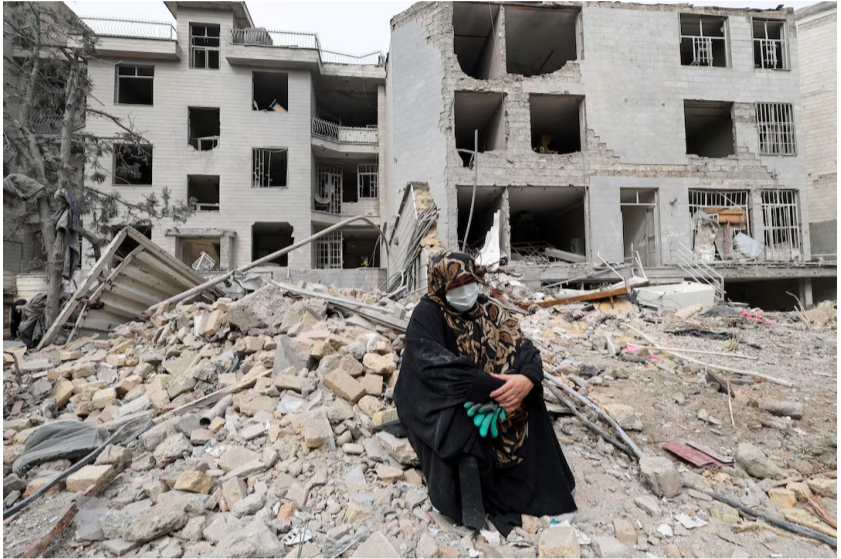
Fear and exhaustion hang over Tehran as ordinary Iranians struggle through economic collapse, repression and the lingering trauma of war.

I n Tehran, the atmosphere is tense and subdued. Repression has intensified, the economy is nearing collapse, unemployment is on the rise and deepening poverty is pushing ordinary people to the brink.