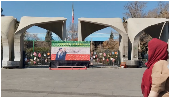
A woman walks past a banner of Iran's slain Supreme Leader at Tehran University. After US and Israeli strikes killed much of the country's top leadership, Iran now faces deep economic crisis and growing uncertainty.