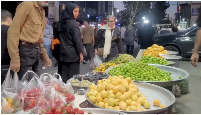
Soaring inflation and shortages of basic goods are pushing millions of Iranians deeper into poverty.

The US naval blockade of Iran has dealt a severe blow to the country's already fragile economy. Surging inflation has deepened public anxiety, while essential imports have slowed dramatically, leading to shortages of medicine, baby formula and basic household goods. The effects are felt in nearly every household. Iran's currency has plunged to a record low of 1,830,000 rials to the US dollar, affecting every aspect of daily life. Before the war started it was around 42,000 to the dollar. 'A pack of eggs now costs almost five times more than before the war. Prices rise every day,' says Sadra, another Tehran resident whose name has been withheld for security reasons. 'Bread has become extremely expensive. So has petrol, oil, car parts, and rent.'