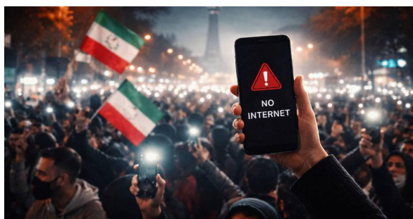
Internet blackouts, surveillance and street checkpoints have deepened fear and isolation inside Iran. Image AI generated

Alongside the economic collapse, repression has also intensified. By the end of May, Iranians had endured more than 90 days without access to the global internet, leaving a population of nearly 90 million people cut off from the outside world as authorities feared another wave of anti-government protests. 'Our voice has been cut off,' says Armin. 'Without the internet, we are living under enormous mental pressure. Many businesses depended on the internet. Now they are ruined. We are facing extreme psychological stress, anxiety and hardship in every possible way.'